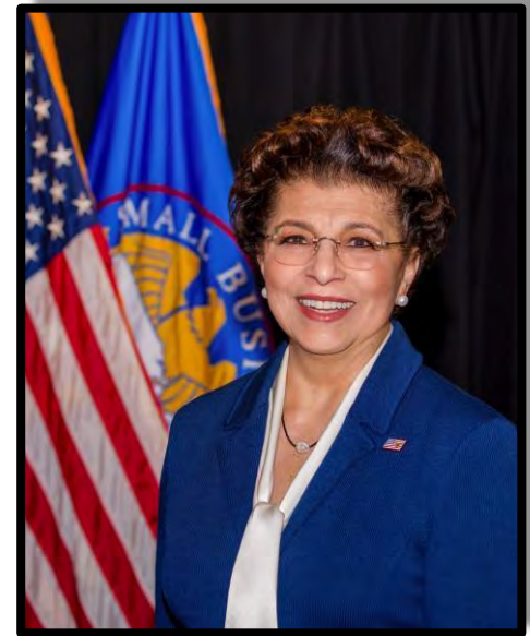
SBA Administrator Jovita Carranza