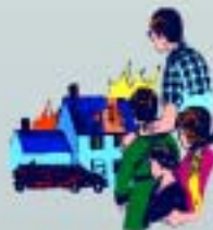
Disaster and Fire